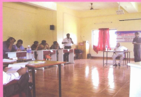
A scene from the debate

The 63rd Independence Day of our Mother Land was celebrated in the campus in a colourful manner. The unfurling of the Tricolour was done by Principal Dr.S.P.Subramanian at 9.30 am and delivered Independence Day message.