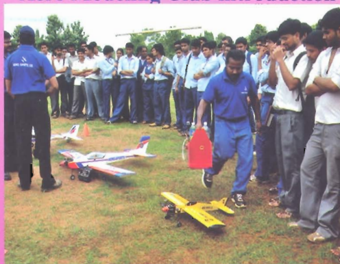
Aero modelling Club Introductory Session