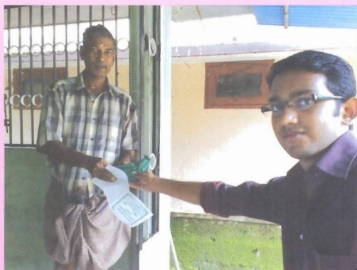
House to house campaign during plastic free environment program organized by NSS VAST units

College National Service Scheme units and Rotaract club jointly organized a campaign on plastic free environment as a part of Independence Day celebrations. The members of National Service Scheme units and Rotaract club conducted a house to house campaign and distributed cotton carry bags and palm lets to 250 houses in the Velur and Kaiparambu Grama Panchayath premises. The campaign was a grant success and the effort of the students to impart an awareness of the hazards of the usage of plastic was highly appreciated